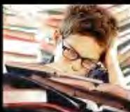
What my church thinks I do