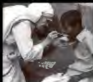
What I should do