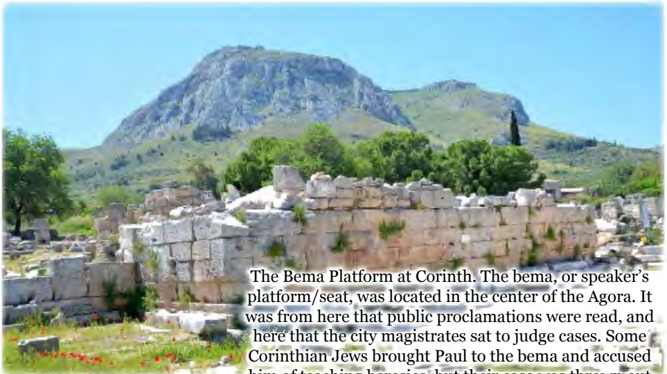
The Bema Platform at Corinth. The bema, or speaker's platform/seat, was located in the center of the Agora. It was from here that public proclamations were read, and here that the city magistrates sat to judge cases. Some Corinthian Jews brought Paul to the bema and accused him of teaching heresies, but their case was thrown out of court, and the ruler of the synagogue (Sosthenes) was beaten by his own people (Acts 18:12-18). The Acrocorinth can be seen in the background. ( Bible Lands Photoguide )