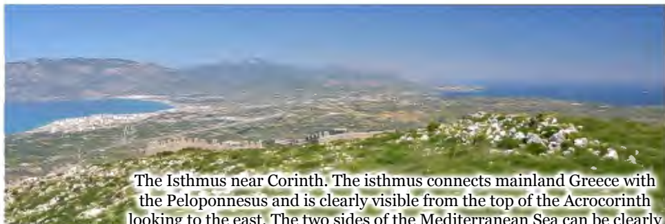
The Isthmus near Corinth. The isthmus connects mainland Greece with the Peloponnesus and is clearly visible from the top of the Acrocorinth looking to the east. The two sides of the Mediterranean Sea can be clearly seen on the left and right sides of the picture. Because of this isthmus, Corinth benefited from the trade between northern and southern Greece, as well as from the Mediterranean sea-trade.