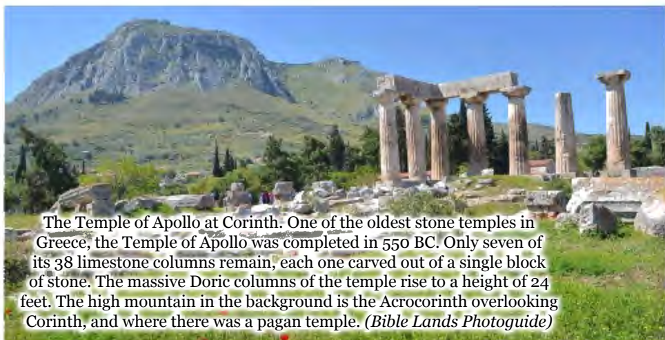
The Temple of Apollo at Corinth. One of the oldest stone temples in Greece, the Temple of Apollo was completed in 550 BC. Only seven of its 38 limestone columns remain, each one carved out of a single block of stone. The massive Doric columns of the temple rise to a height of 24 feet. The high mountain in the background is the Acrocorinth overlooking Corinth, and where there was a pagan temple.