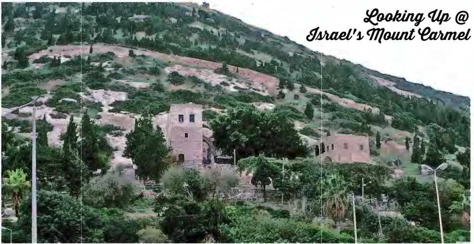
Looking Up @ Israel's Mount Carmel