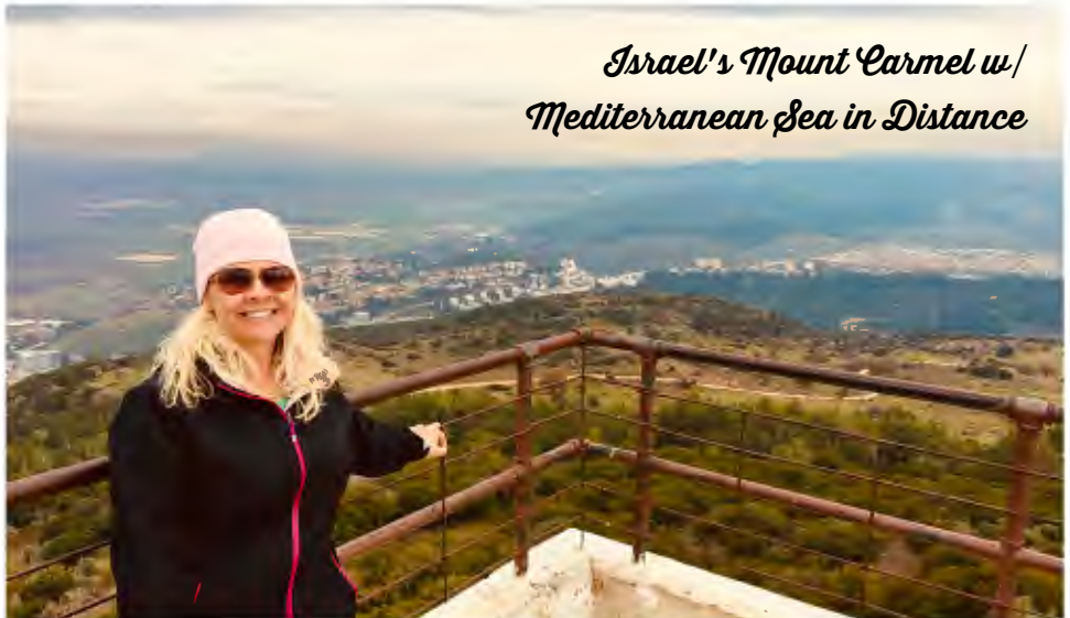
Israel's Mount Carmel w/ Mediterranean Sea in Distance

1) You Want Trouble? I'll Show You Trouble... (1 Kings 18:17-19; Song of Songs 7:5; Isaiah 35:2)