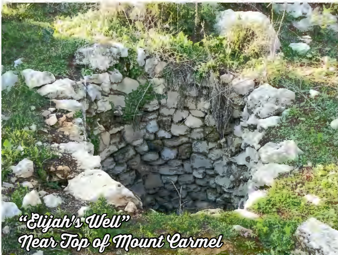
"Elijah's Well" Near Top of Mount Carmel